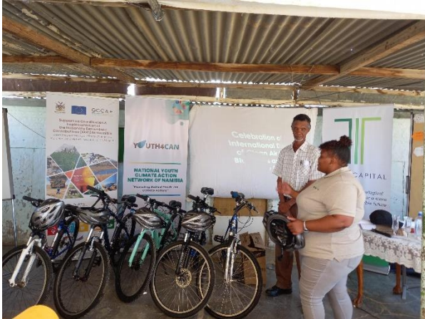
Image 7: Youth4CAN handing over the bicycles to the conservancy senior game guard.