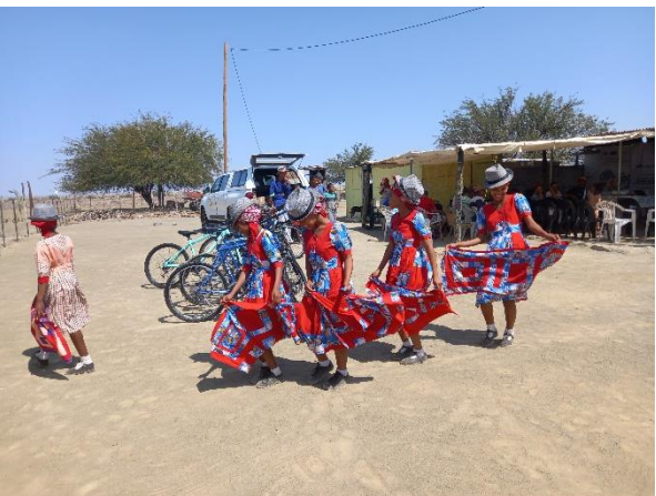
Image 2 and 3: Blou Wes Primary School Cultural group welcoming the donations.