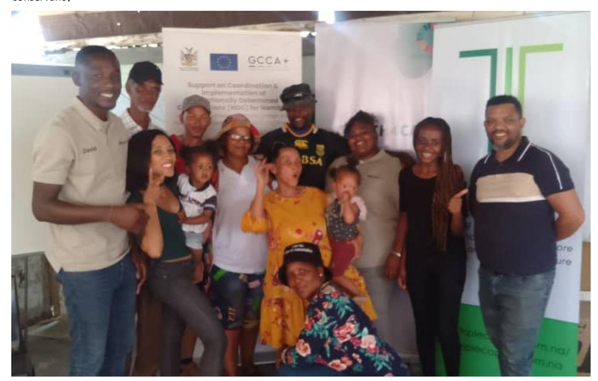
Image 10: Members of the conservancy snapped with Youth4CAN, Triple Capital and GIZ CCIU-EU Project delegations